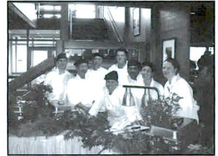
Anthony's HomePort staff help make a fun event!

The Des Moines Legacy Foundation and Anthony's Restaurants invite you to attend the fifth annual Bayside Brunch on Sunday, November 7th, 10 a.m. to 12:30 p.m. at Anthony's HomePort at the Des Moines Marina.