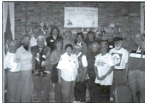
Some of our wonderful volunteers.

Tickets for this event are on sale now and will also be available at the door. For more information, please call the Des Moines Senior Center, 206-878-1642. All proceeds support senior programs and services.